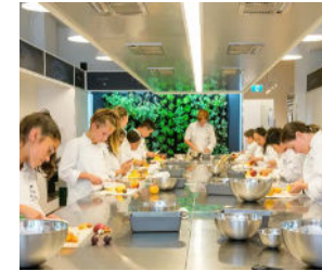
LITTLE KITCHEN ACADEMY 1,500–2,000 SF

For families seeking educationally-enriching activities for their children ages 3–18, LKA is the first-of-its-kind Montessori-inspired cooking academy providing a safe and empowering environment to learn practical life skills, confidence, independence, and healthy eating habits to last a lifetime.