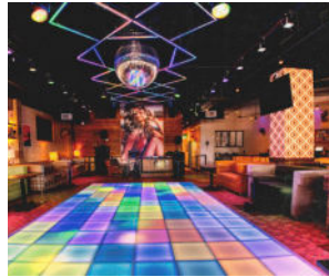
GOODNIGHT JOHN BOY 4,000–6,000 SF