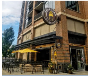
BEERHEAD 3,500–4,000 SF

Beerhead is a craft beer bar featuring 50 taps and an endless bottle selection of American craft, import, and specialty beers, spirits and tasty food menu.