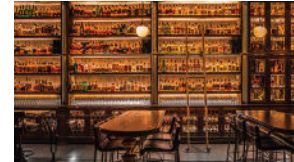
F1 ARCADE 15,000–17,000 SF

F1 Arcade is from Adam Breeden, co-founder of Puttshack, Flight Club, and Bounce—and an exclusive partnership with Formula 1. The F1 Arcade is an immersive, state of the art F1 racing simulation experience, gamified for a mass audience in a premium venue with 'best in class' hospitality and design.