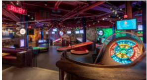
PUTTSHACK 25,000–30,000 SF

REAL ESTATE | DATA | SUPPLY CHAIN REVENUE | FINANCE | HIRING