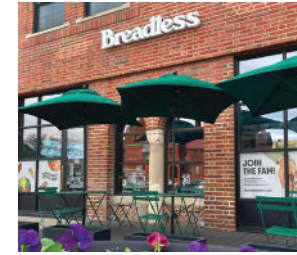
BREADLESS 1,500–2,250 SF

Breadless sandwiches and bowls combine the nutrition of super greens with the flavor of fine dining. 100% gluten-free and offering meat, vegan, keto and Whole30 options, it is always nutritious, flavorful, and low-carb.