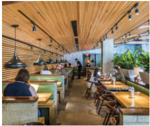
NORTHSTAR 5,000 SF

Modern, organic New American cuisine with counter service, an open kitchen & house-baked sweets. Focusing on using local, organic and sustainable ingredients.