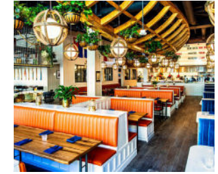
PLANK SEAFOOD PROVISIONS 4,500–5,500 SF

Plank Seafood Provisions is a coastal-inspired oyster bar and seafood grill where you can find thoughtful service, notable flavors, and social moments. The menu is faithful to the tradition of fresh seafood, high quality ingredients, and a made-from scratch mentality.