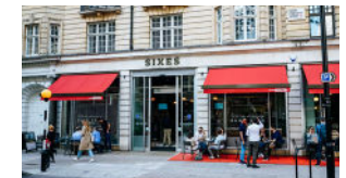
SIXES CRICKET 5,000–7,000 SF

Inspired by the age-old game and all its ceremony, Sixes Cricket Club invites challengers to test their cricket skills against some of the world's greatest players whilst enjoying the very finest of British Gastro Pub inspired food and drinks.