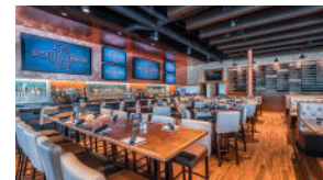
CITY WORKS 6,500–7,500 SF

City Works offers the perfect combination of the best beer bars and upscale restaurants. Along with 90 local and global craft beers on draft and an American menu featuring familiar favorites with a unique twist in a casual environment.