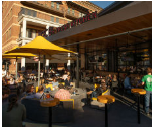
DOC B'S 5,000–7,000 SF

Doc B's Fresh Kitchen was established to become an extension of your own kitchen. By using fresh and mindful ingredients, Doc B's helps to maintain your balanced lifestyle.