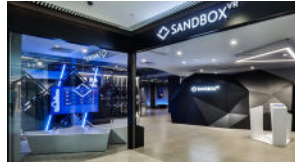
SANDBOX VR 5,000–6,000 SF

Sandbox is a futuristic VR experience for groups of up to 6 where you can see and physically interact with everyone inside, just like the real world. Sandbox VR's funding was led by Andreessen Horowitz and includes investors Justin Timberlake, Katy Perry and Kevin Durant.