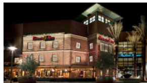
THIRSTY LION 6,500–7,500 SF

Thirsty Lion's culinary commitment is to provide an eclectic variety of multi cultural cuisines with an emphasis on local ingredients, bold flavors and scratch recipes. With a top-of-the-line viewing experience for sports fans of all persuasions and an innovative concepts.