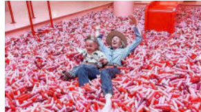
MUSEUM OF ICE CREAM 13,000-20,000 SF

World famous ice cream attraction in NYC, Austin, and Singapore. A multi-sensory experience with immersive installations that reimagines the way we experience ice cream. Museum of Ice Cream brings to life the universal power of ice cream by creating experiences that inspire imagination, helping to rediscover the kid in you.