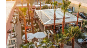
PALMA 6,000–8,000 SF

Engulfed in a nursery of palm trees, Palma is your own private gathering in the heart of Downtown Phoenix. You'll find brunch on the weekends, and sushi, fried chicken, noodles, and shareable bites to capture any appetite. A drink list of wine, sake, and cocktails mixed with a vibe of musical energy makes for a tropical courtyard of greenery bliss inside the concrete jungle of any business district.