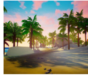
THE DREAM CORPORATION 2,500 - 3,500 SF

The Dream Corporation transports thousands of people every week from city center locations to a LUXURY VIRTUAL RESORT. Visit with your friends and step into the future: enjoy the greatest experiences VR has to offer, spanning entertainment, arts and gaming.