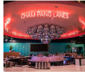
CHÂM PANG LANES 4,500–5,500 SF

Châm Pang Lanes is a place to escape to with a dreamy, utopia side. Cocktail hour is our favorite hour and we believe life is meant to be enjoyed, so let's drink champagne and eat fried chicken.