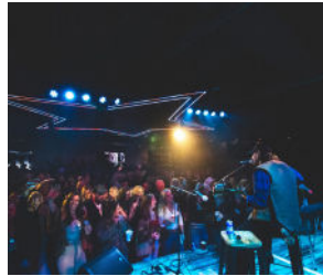
WELCOME TO THE FARM 5,000–7,000 SF

Nashville-Inspired Live Music Country Bar from Chase Rice. Live music, good bourbon, cold beer, smoked meats, and sports.