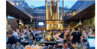
FEDERALES 8,000–10,000 SF

FEDERALES is a lofty, open-air tequila and taco concept with an energetic atmosphere. A variety of wood-fired meats serve as the centerpiece of this lively, tongue-in-cheek take on a Mexican watering hole, where tequila flows like water and memories soon to be forgotten are made.